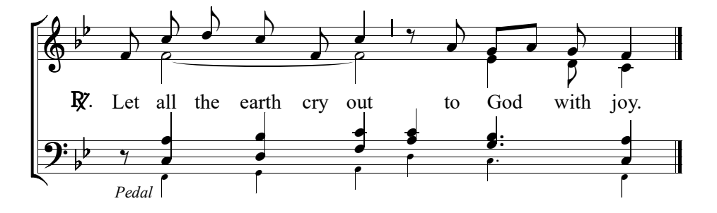
RESPONSORIAL PSALM Let all the earth cry out to God with joy (III)